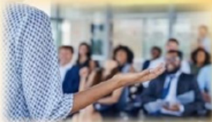
Employment Skills Training

In 2019, the organization will be celebrating its 50th year of assisting & helping to develop minority employees into leadership positions within (and outside) the Internal Revenue Service and have contributed to the agency's reputation as the most efficient governmental tax administration on the planet.