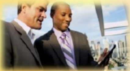
Mentoring & more

Ways that you can give to our organization: