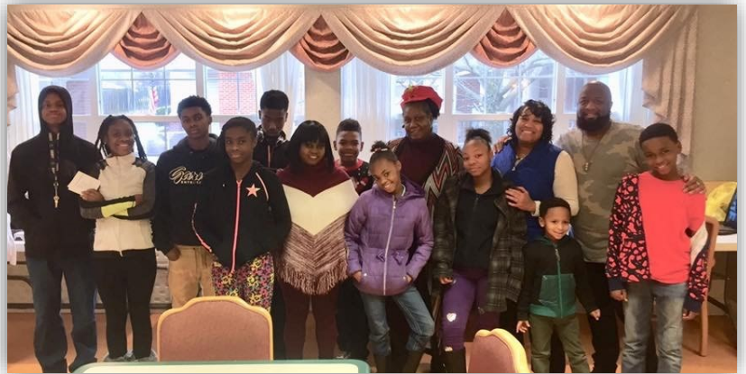
The St. Mark Fellowship Christian Fellowship Youth Ministry sung several Christmas carols to bring the residents some holiday cheer.